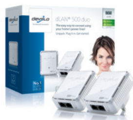
dLAN® 500 duo Starter Kit