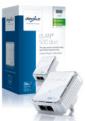
dLAN® 500 duo

Two Fast Ethernet LAN connections—use the second LAN port to connect another device simultaneously.