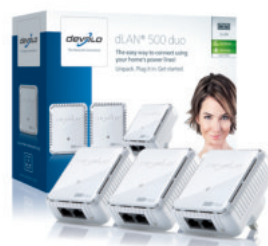
dLAN® 500 duo Network Kit